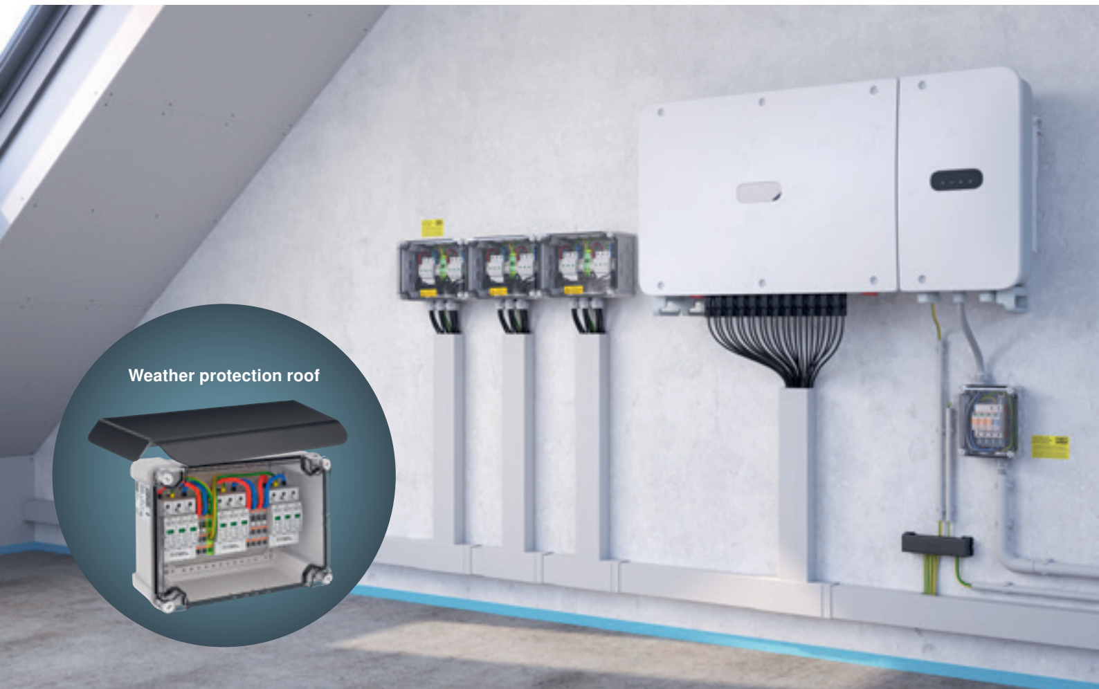
Weather protection roof